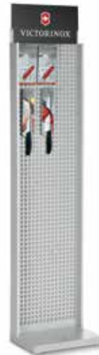
9.6155 Freestanding Blister Display 17"W X 12.75"D X 75"H