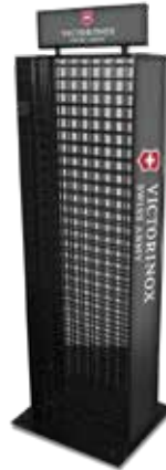
10013 2-Sided Display on Casters 20"W X 60"H X 18"D (Ships with 30 hooks)