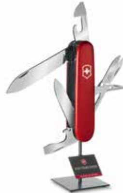
9.6001.1 Electric Knife Display 110V 23.62"L X 9.84"D X 31.5"H