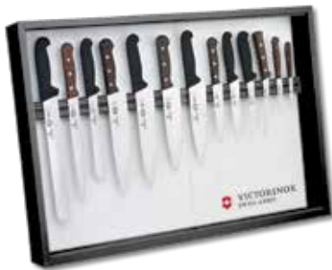
10001 Display Cabinet Hangs or stands 31½"W X 22¼"H X 5"D

Available with lockable sliding doors for ease of access.